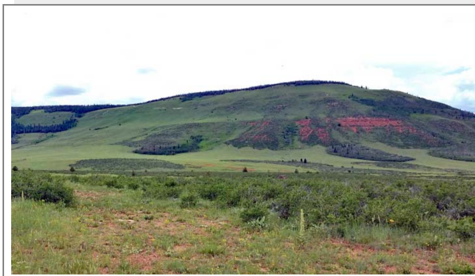
Photo not of the property however represents characteristics of the property